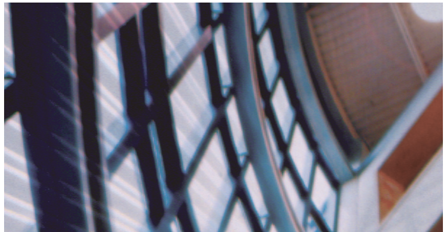
Terra Tech College—interior view of lobby of the engineering building— Ohio— 1994—Needham & Associates